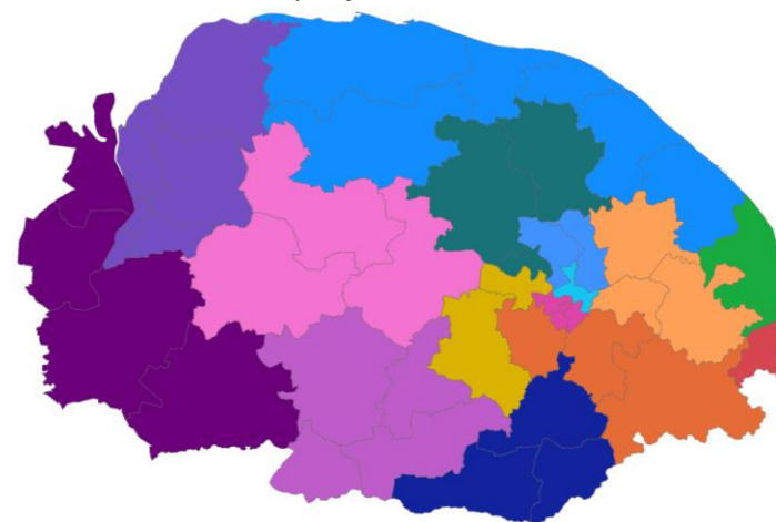
Anonymised aggregated view of vulnerabilities/needs split by zone initially

"I want to see where best to commission services / what needs are in a specific area."